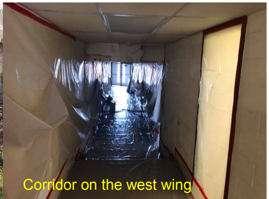
Corridor on the west wing

Please mark your calendar as we are planning to have a GIVING DAY on June 26 from noon to June 27 noon for phase 2 construction (new Multipurpose Hall). This will give everyone a new opportunity to make new gifts and pledges to go towards our phase 2 need of $349,400. We will have more details soon. I want to say a big thank you to those who have responded to the matching grant ($150,000) we announced last month. You have helped us matched $50,600 within such a short time! The opportunity is still wide open to donate and double your money as we are yet to match $90,400.