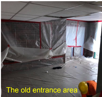
The old entrance area

It is with a great excitement that we share some of our renovation pictures! As you can see in the pictures, we are making progress and we cannot wait to go back to a renovated and expanded building! Thank you very much for your recent donation to the Bethel ministry. You enable us to offer Hope to our children, youth, seniors, and families that are struggling financially. Our partnership in reaching out to our community has produced lasting results in the lives of the people we work with, and we are very grateful to you.